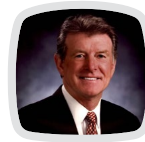
C.L. "Butch" Otter Governor of Idaho