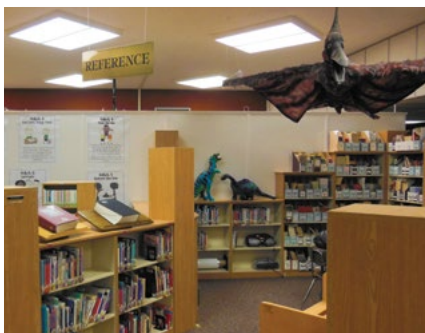
Photo-right: Lottery funds helped build a wall between the computer lab and the library at Wilcox Elementary in Pocatello.