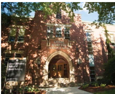
Photo-left: Lottery funds helped put a new roof on the Lionel Hampton School of Music at the University of Idaho.

While thousands upon thousands of people purchased tickets and imagined what they would do when winning the jackpot, Idaho's public schools and the State's permanent facilities realized beneficial improvements. Places like Valley View Elementary in west Boise who constructed a new school vehicle entryway that can safely handle the influx of cars, buses, and students. In north-central Idaho, a much-needed roof replacement and recent facility improvements to the University of Idaho's Lionel Hampton School of Music now provide outstanding facilities to promote great learning. And in eastern Idaho, Pocatello's Wilcox Elementary School built a wall around their computer lab resulting in improved testing scores for their students. These projects showcase how Lottery dividend dollars are translated into meaningful projects that improve student safety and scholastic achievement.